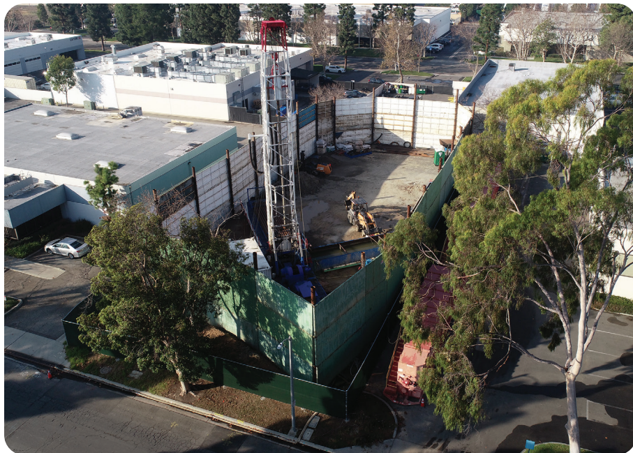
Croddy Well 14 construction site

As part of a California Department of Water Resources $55 million multi-year grant that was awarded to five regional water agencies in the Santa Ana Watershed Project Authority, Mesa Water is eligible to receive funding for the construction of Croddy Well 14, one of two new wells that will increase local groundwater production capacity.