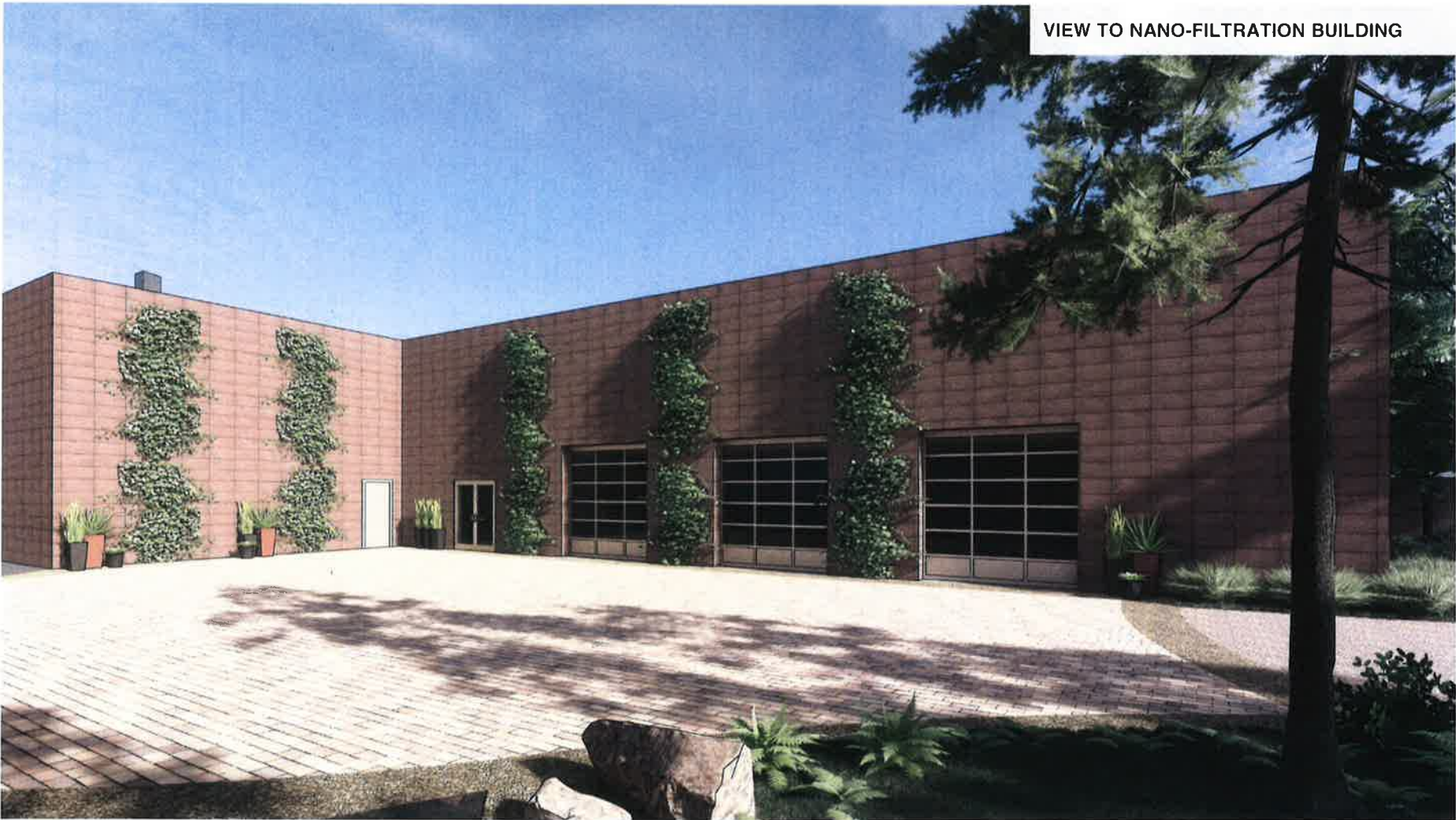
MESA WATER OUTREACH CENTER RENDERINGS