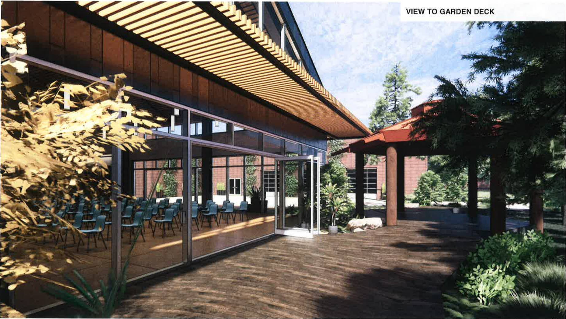
MESA WATER OUTREACH CENTER RENDERINGS