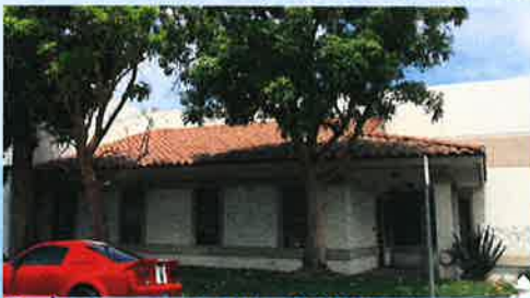
3 | August 25, 2020