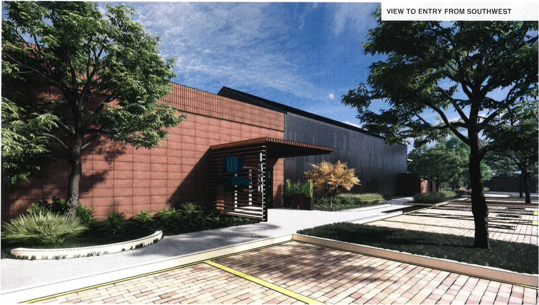
MESA WATER OUTREACH CENTER RENDERINGS