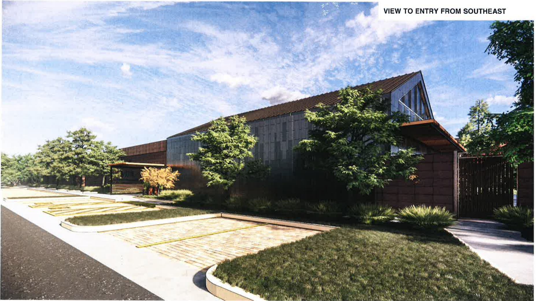
MESA WATER OUTREACH CENTER RENDERINGS