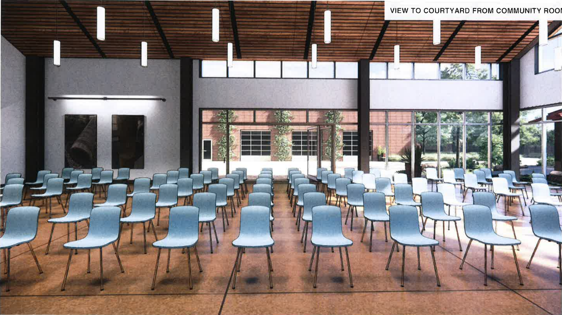
MESA WATER OUTREACH CENTER RENDERINGS