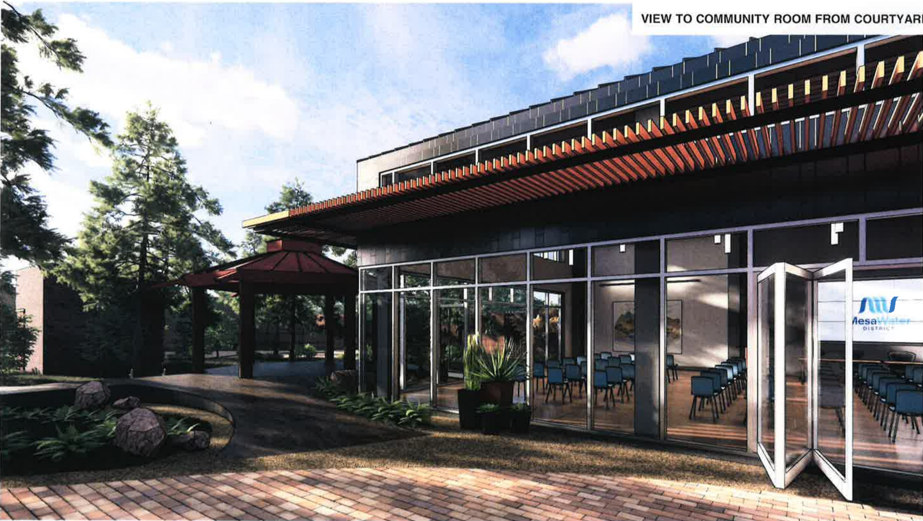
MESA WATER OUTREACH CENTER RENDERINGS