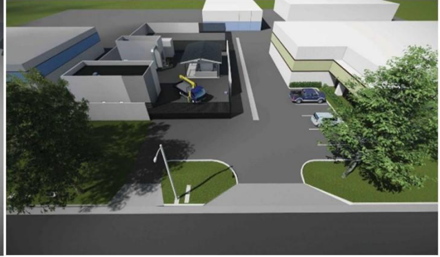
Well No. 14 – Street view